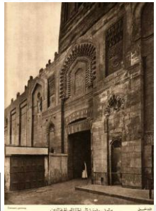
The Mosque ,Madrasa & Qubbat al-Salih Najm al-Din Ayyub, Cairo